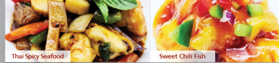
Thai Spicy Seafood Sweet Chili Fish