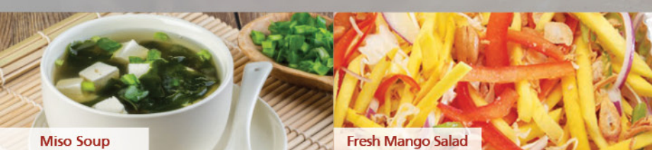
Miso Soup Fresh Mango Salad