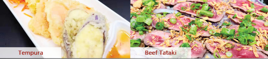
Tempura Beef Tatakis